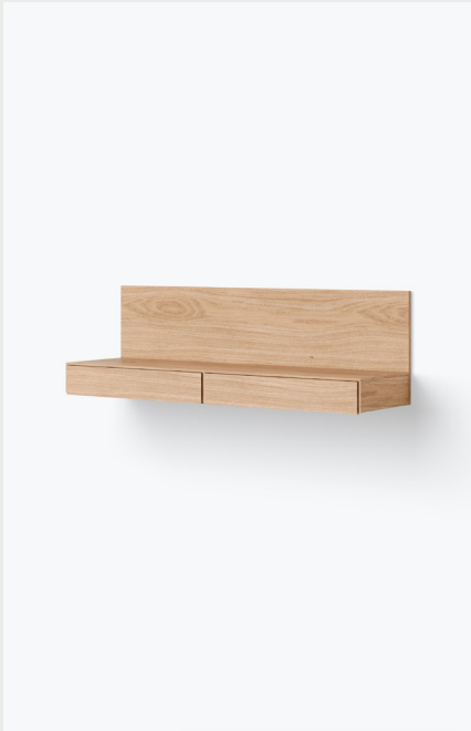
Variant Oak Item No 42440 EAN No 5712826424407