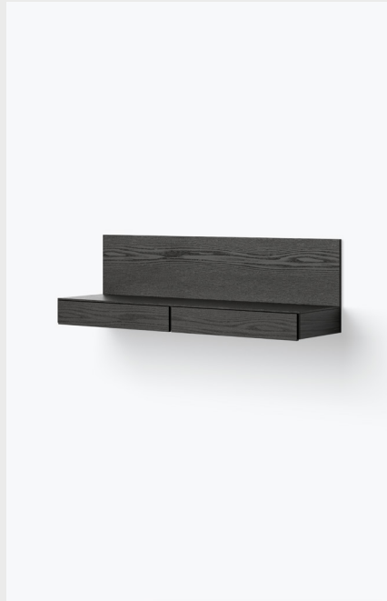
Variant Black Stained Oak Item No 42441 EAN No 5712826424414